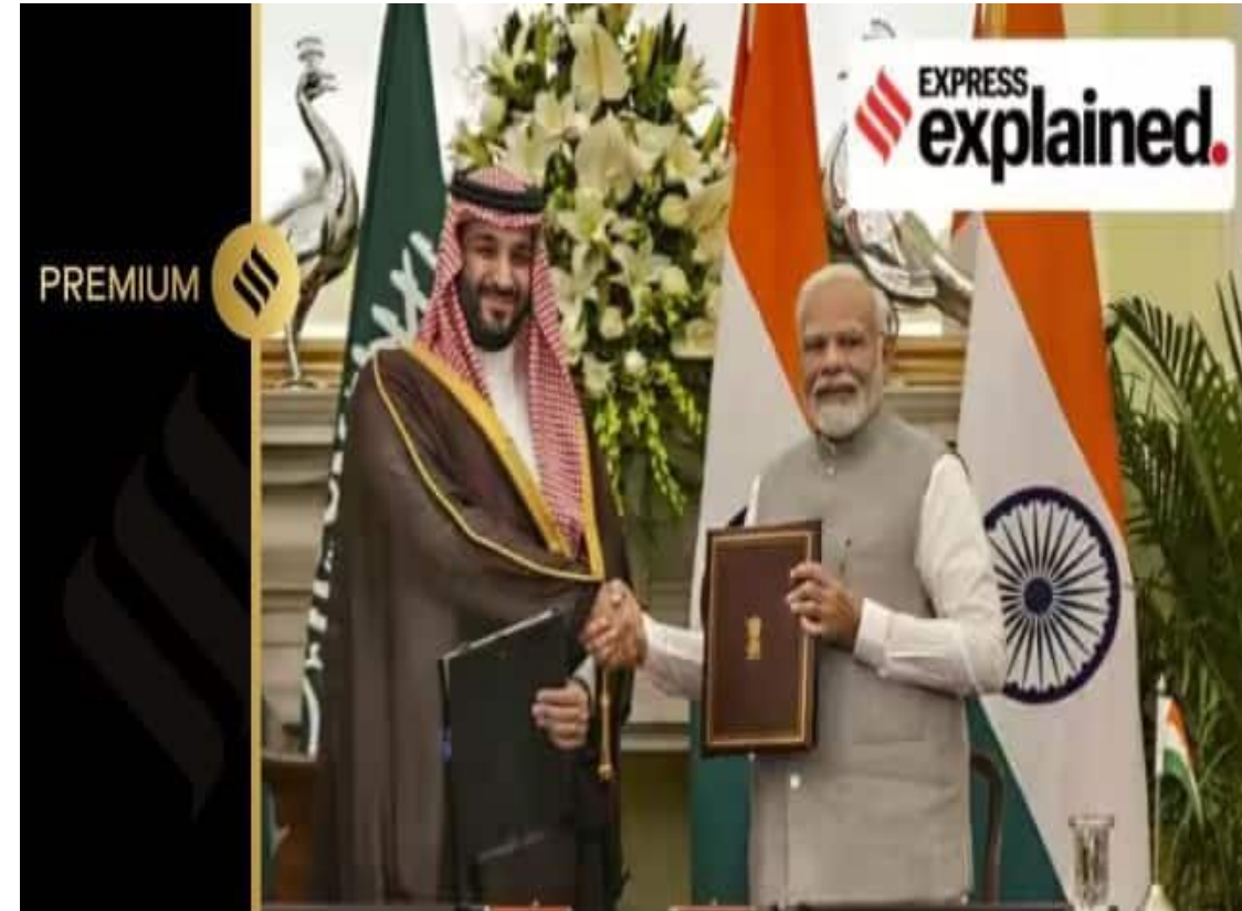
Prince Mohammed bin Salman (MBS) with PM Modi