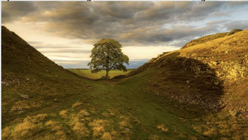
Figure 1 Sycamore Gap Tree